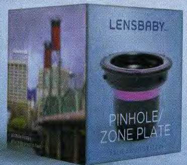
Pinhole/Zone plate - one of the OPTIC SWAP SYSTEM options for LENSBABY™ SLR lenses

To Request Information on RS# 63, See Page 6.